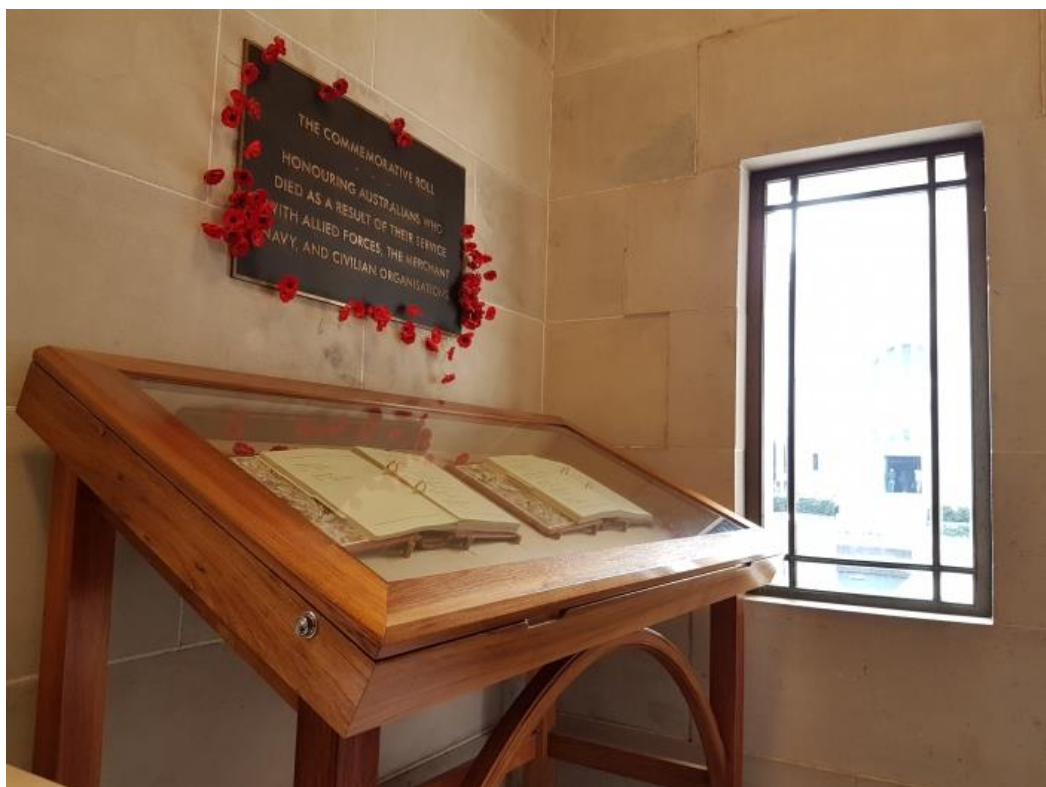
Commemorative Roll