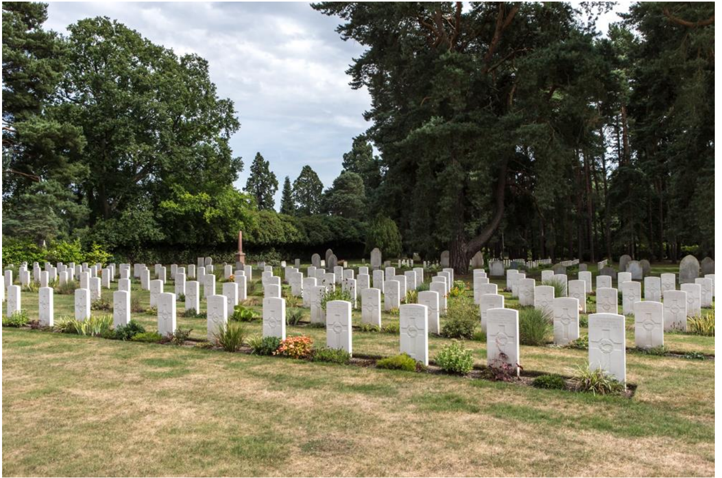
New Zealand War Graves in Brookwood Military Cemetery